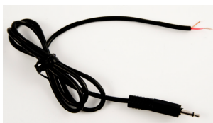
Connecting a function generator to the Power Amplifier with a mono audio cord

The Vernier Power Amplifier can be used with most function generators. Connect the function generator to the 3.5 mm input using a mono connector only. A stereo connector may enable the PWM features of the Power Amplifier with undesirable results. When used with this input, the Power Amplifier applies a factor of ten gain to the input signal. The input is DC-coupled.