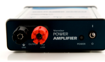
The front of the Power Amplifier, showing the output terminals, the Power Indicator LED, and the On/Off Switch