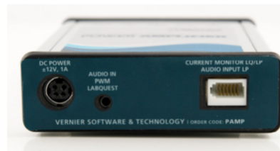
The back of the Power Amplifier, showing the Power Connector, the Audio/LabQuest Connector, and the BTA Connector