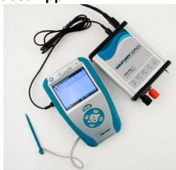
Power Amplifier connected to a LabQuest audio out connector

The Power Amplifier requires a LabQuest 3, LabQuest 2, or original LabQuest with LabQuest App 1.2 or newer. (LabQuest App 1.3 or newer is recommended.) Launch the LabQuest Power Amplifier App by selecting it in the home menu. If it is not present in the home menu, see www.vernier.com/labquest/updates/ for information on updating your original LabQuest.